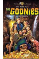
The Goonies (PG)